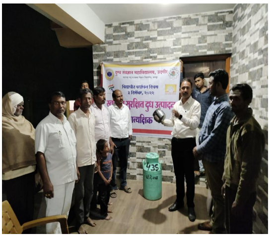
Demonstration on Clean Milk Production